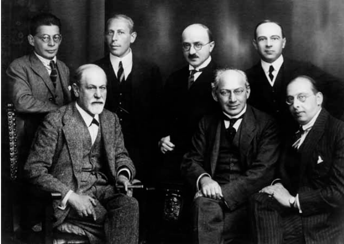
Left to right, seated: Sigmund Freud, Sándor Ferenczi, Hanns Sachs. Standing: Otto Rank, Karl Abraham, Max Etingon, Ernest Jones. 1922

New Center for Psychoanalysis is introducing a historic Archival Collection from its Repository. This Archival Collection comprises thousands of documents reflecting, in a broader sense, on multifaceted discourses of the Psychoanalytic Movement in Los Angeles, as well as on scientific narratives, elucidating the modern and postmodern Theories of Psychoanalysis. The earliest documents are dated by the late 19th century, while the contemporary documents are related to the nowadays scientific works.