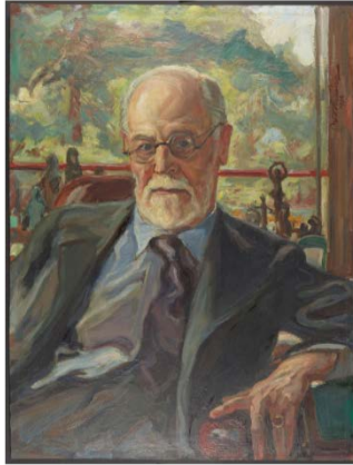
Sigmund Freud, portrait by Victor Krausz, 1936