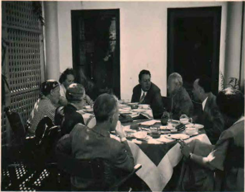
Psychoanalytic Study Group of Los Angeles, March 1944.

The mature and healthy ego is unaware of itself while functioning in accordance with the demands of object reality.