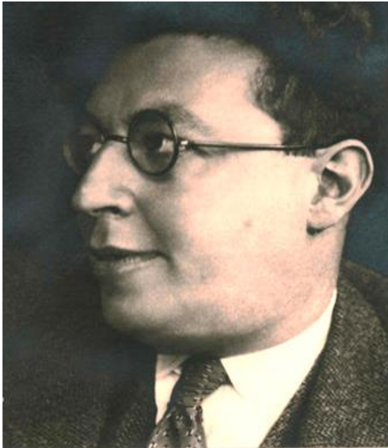
Dr. Otto Fenichel, 1940s

In May 1938 with the great help of Ernst Simmel he and his family managed to emigrate from Czechoslovakia to the United States and settled in Los Angeles. The Los Angeles period was marked by his intensive work in scientific and practical psychoanalysis.