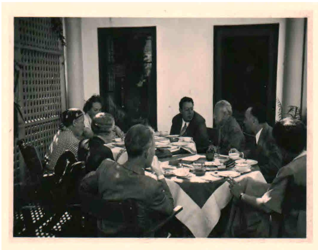
Psychoanalytic Study Group of Los Angeles, Meeting in March 1944

This photograph below depicts the leading members of the Los Angeles Psychoanalytic Group at the meeting.