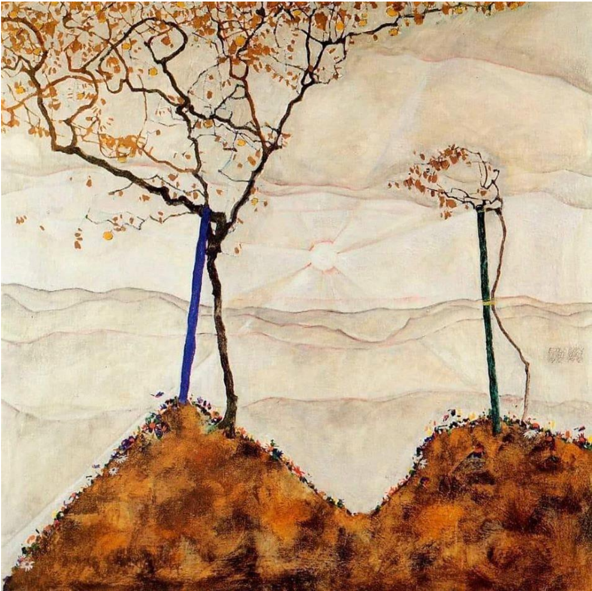
Egon Schiele, Autumn, Sun, 1912

Before describing this Collection, it would be sensible enough to make a remark on the Vienna's cultural milieu in the beginning of the 20 th century. It was Austrian by form and multi-subconscious by content. I believe this painting by Egon Schiele may reflect on such a subconscious level. He painted Autumn in 1912, the same year when Sigmund Freud worked on Totem and Taboo and on Narcissism .